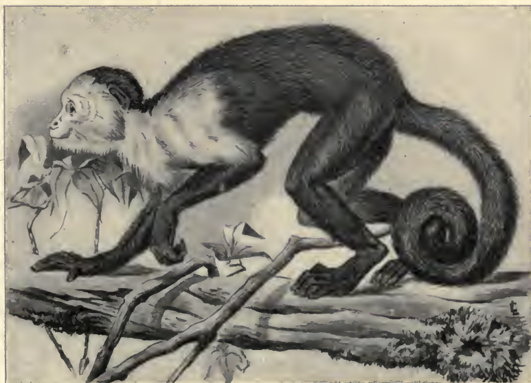
FIG. LXXXV. CEBUS HYPOLEUCUS . WHITE-THROATED CAPUCHIN.